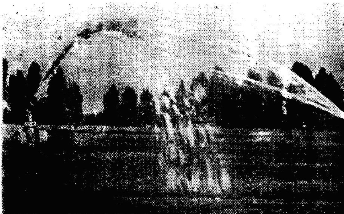
Fig.2 Demonstrations of the micro irrigation regime with the use of IDAH in conditions of irrigation of sugar beet, maize for power and soya in the Terter AIS of the Institute of "Agriculture".

Soaking of the soil during watering did not exceed 30-60 cm. Greater wetting and better uniform moisture distribution under these conditions is achieved with irrigation rates of more than 300-400 m 3 / ha. At such rates about 60-70% of water remains in the upper (20 cm) layer, and the plants are not completely supplied with moisture.